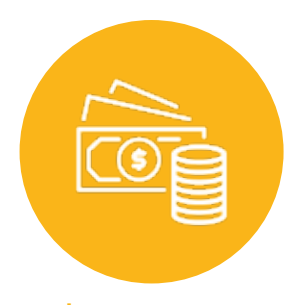
$600 MM New assets generated