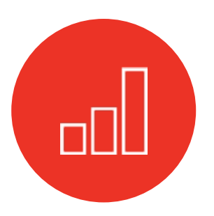
26% Sales increased in past year

FTI's 'Advisor Genomics' personalized behavioral and contact strategy system developed by Fractal resulted in: